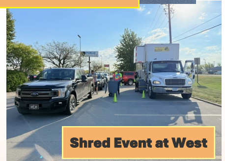
Shred Event at West