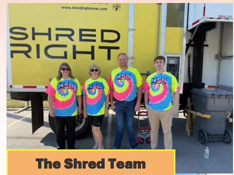
The Shred Team

The Shred Event in Mason City on September 21st had a great community turnout! We shredded 4980 pounds of paper which saves about 42 trees! The event collected 172 pounds of food donations which went to the Hawkeye Harvest Food Bank.